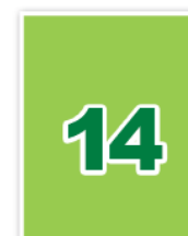
Page 3, 5 Full Page 265mm x 327mm