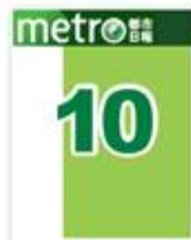
Front Page Junior Page 202mm x 280mm