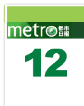
Front Page Top Banner 260mm x 50mm