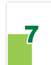
1/4 Page 130mm x 153mm