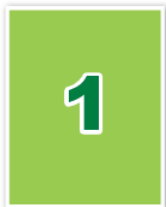
Full Page 265mm × 327mm