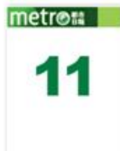
Front Page Right Sky Box 55mm x 40mm