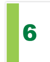
Vertical Strip 85mm x 327mm