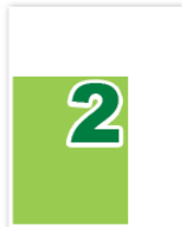
Junior Page 175mm x 215mm