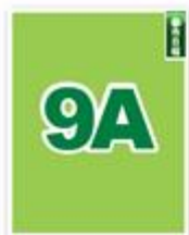
Mega Front Cover 265mm x 327mm