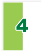
Vertical Half Page 130mm x 327mm