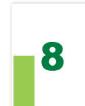
1/6 Page 85mm x 153mm